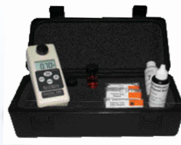
Colorimeter shown with kit which includes ready-to-use reagents.