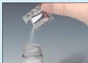
Total chlorine reagent in foil packet