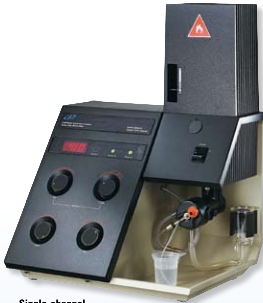
Single-channel flame photometer