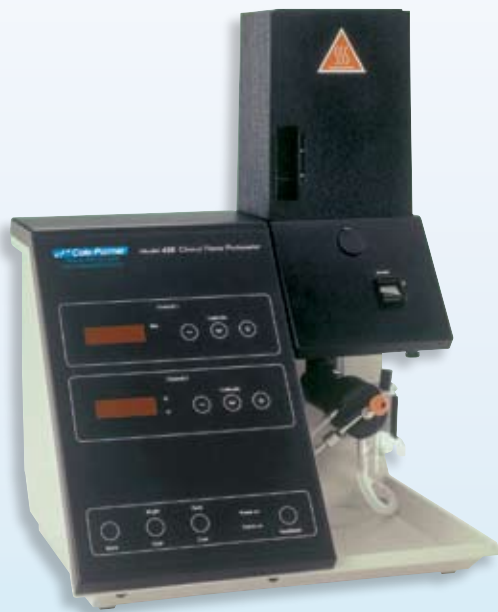
Dual-channel flame photometer